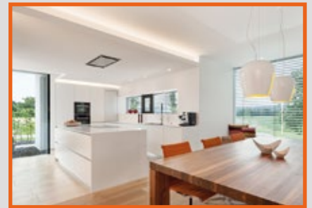
Best design results