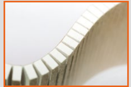
Three-dimensional molded parts