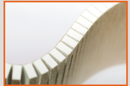
Three-dimensional molded parts